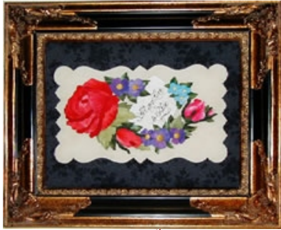
"A Little Token of Affection" -